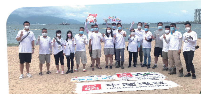
舊咖啡灣沙灘清潔活動 Cafeteria Old Beach Cleanup Activity