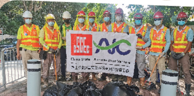
青山公路青山灣段馬路及行人道清潔活動 Section of roads and pedestrian walkway along Castle Peak Road Cleanup Activity