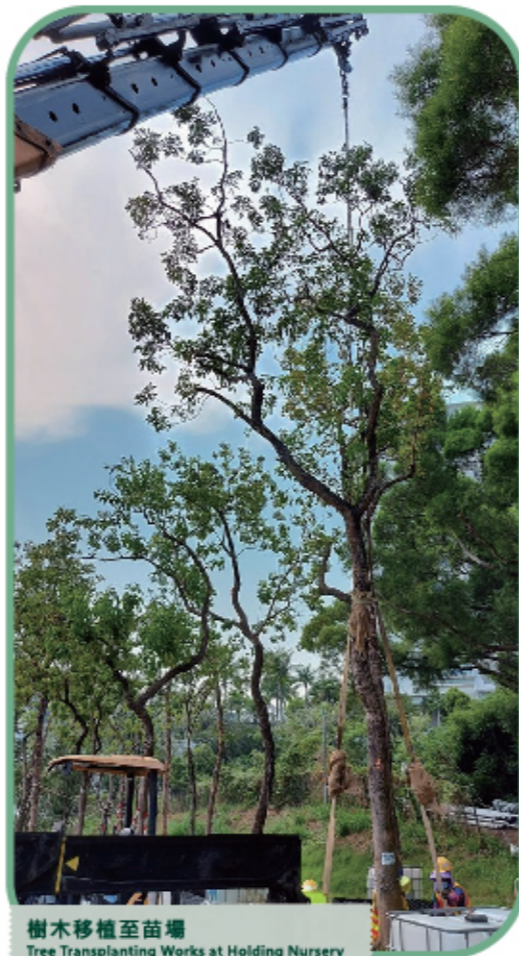
樹木移植至苗場 Tree Transplanting Works at Holding Nursery