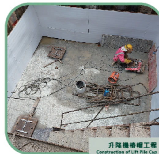
升降機樁帽工程 Construction of Lift Pile Cap