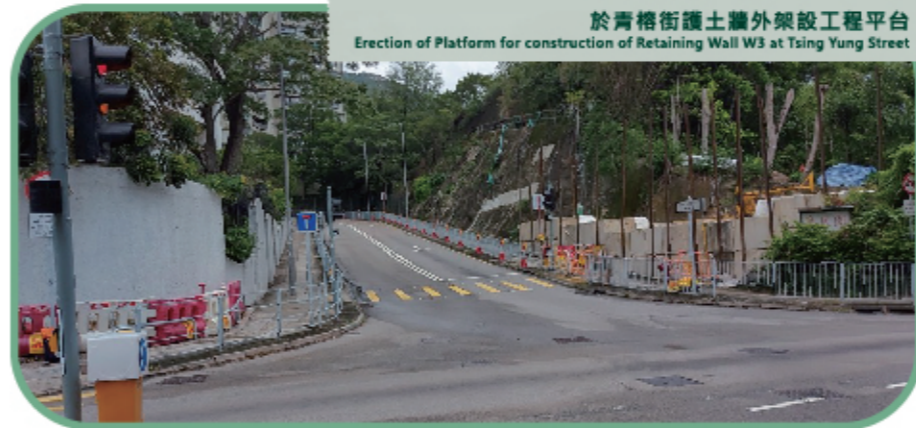
於青榕街護土牆外架設工程平台 Erection of Platform for construction of Retaining Wall W3 at Tsing Yung Street