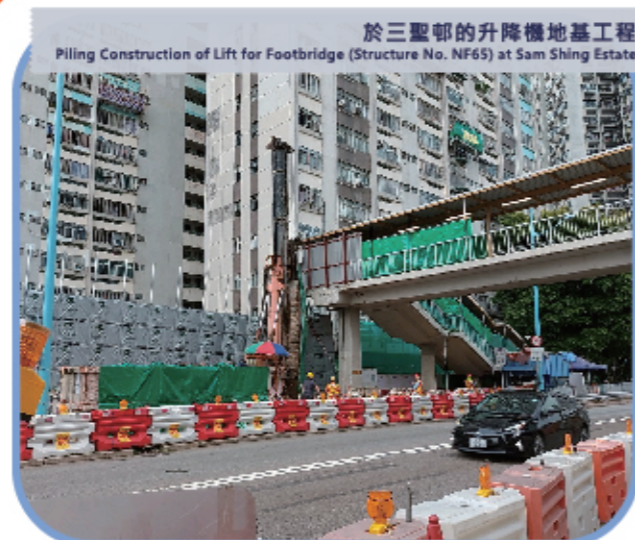
於三聖邨的升降機地基工程 Piling Construction of Lift for Footbridge (Structure No. NF65) at Sam Shing Estate