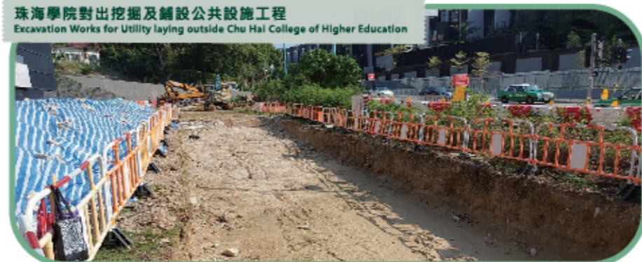
珠海學院對出挖掘及鋪設公共設施工程 Excavation Works for Utility laying outside Chu Hai College of Higher Education