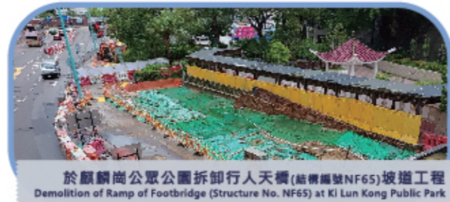
於麒麟崗公眾公園拆卸行人天橋(結構編號NF65)坡道工程 Demolition of Ramp of Footbridge (Structure No. NF65) at Ki Lun Kong Public Park