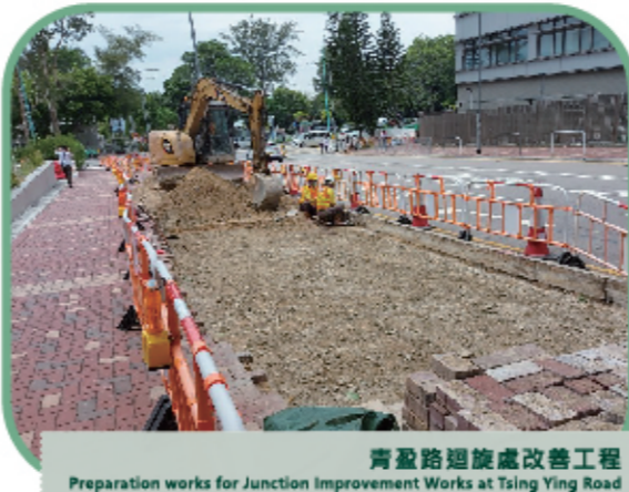
青盈路迴旋處改善工程 Preparation works for Junction Improvement Works at Tsing Ying Road