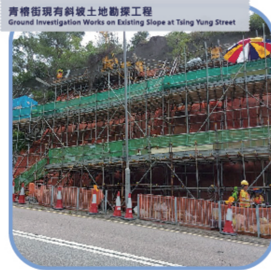
青榕街現有斜坡土地勘探工程 Ground Investigation Works on Existing Slope at Tsing Yung Street