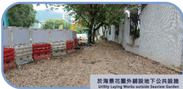
於海景花園外鋪設地下公共設施 Utility Laying Works outside Seaview Garden