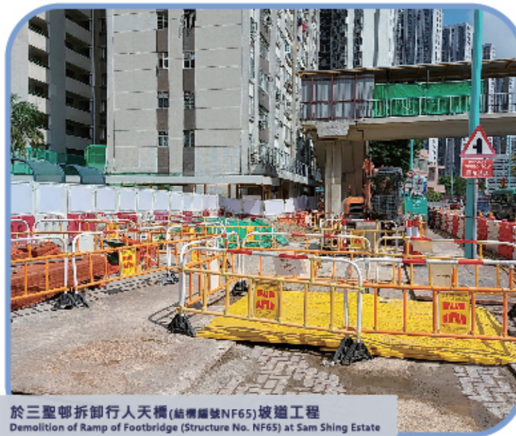
於三聖邨拆卸行人天橋(結構編號NF65)坡道工程 Demolition of Ramp of Footbridge (Structure No. NF65) at Sam Shing Estate