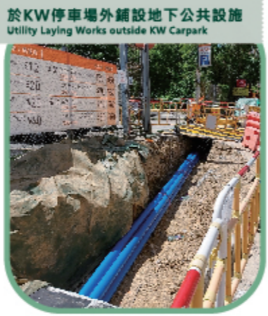
於KW停車場外鋪設地下公共設施 Utility Laying Works outside KW Carpark