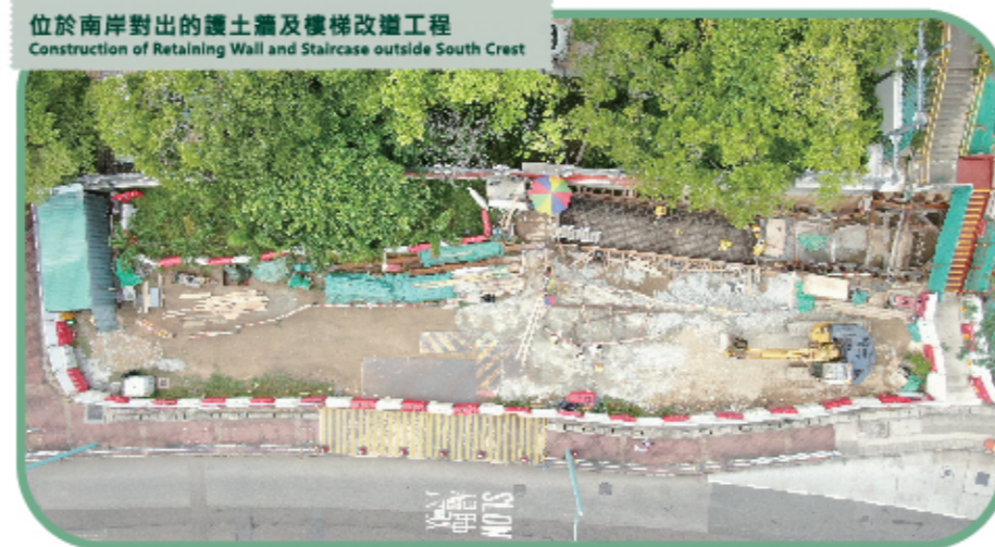
位於南岸對出的護土牆及樓梯改道工程 Construction of Retaining Wall and Staircase outside South Crest