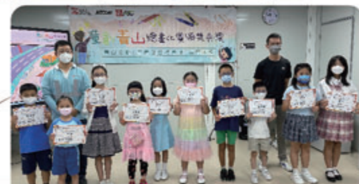
「童創青山」繪畫比賽頒獎典禮 Drawing Competition Award Ceremony