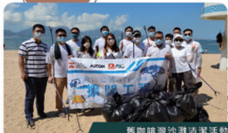
舊咖啡灣沙灘清潔活動 Cafeteria Old Beach Cleanup Activity