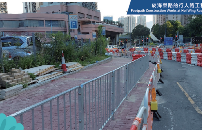
於海榮路的行人路工程 Footpath Construction Works at Hoi Wing Road