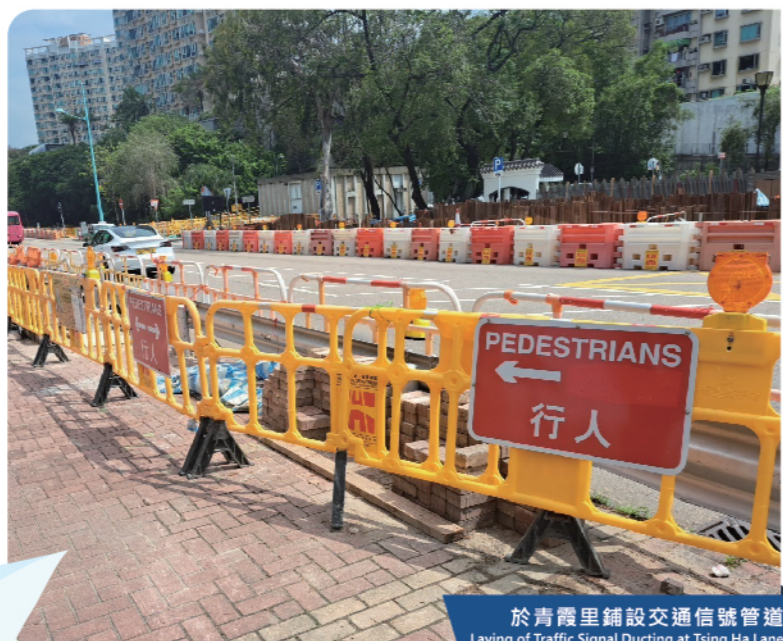
於青霞里鋪設交通信號管道 Laying of Traffic Signal Ducting at Tsing Ha Lane