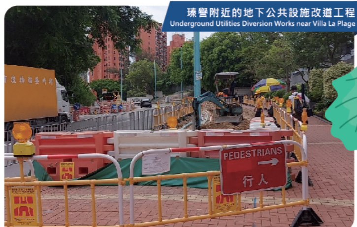
瑠響附近的地下公共設施改道工程 Underground Utilities Diversion Works near Villa La Plage