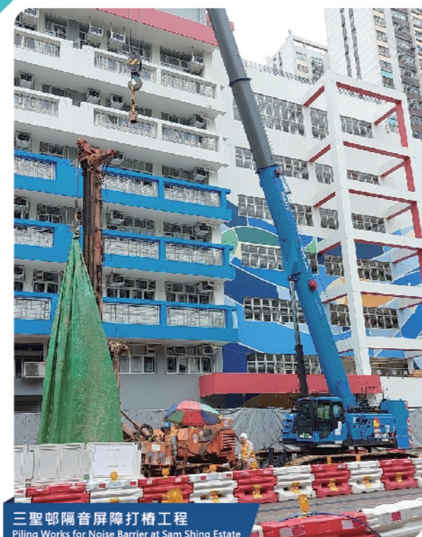
三聖邨隔音屏障打樁工程 Piling Works for Noise Barrier at Sam Shing Estate