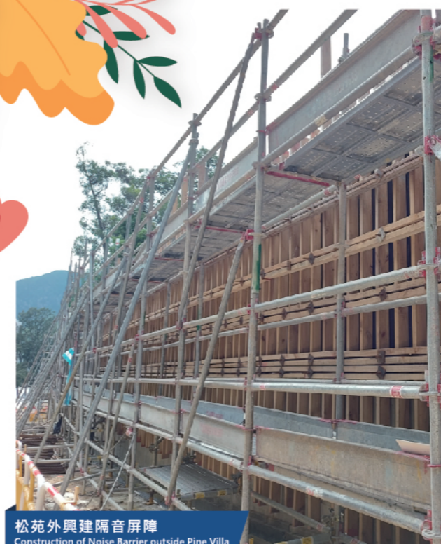
松苑外興建隔音屏障 Construction of Noise Barrier outside Pine Villa