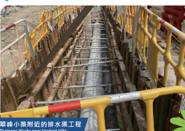
翠峰小築附近的排水渠工程 Drainage Works near Verdant Villa