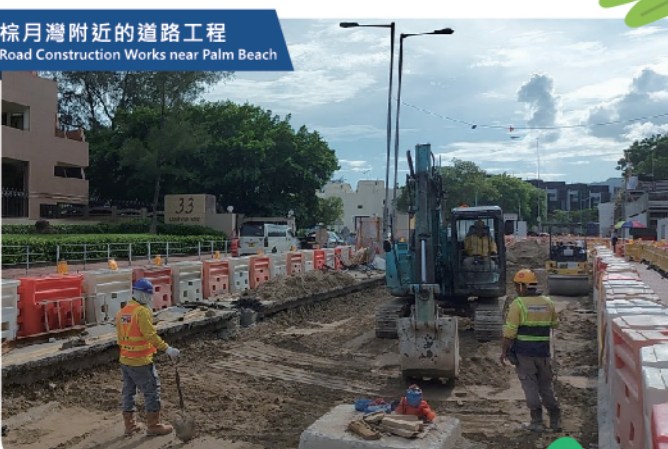
棕月灣附近的道路工程 Road Construction Works near Palm Beach