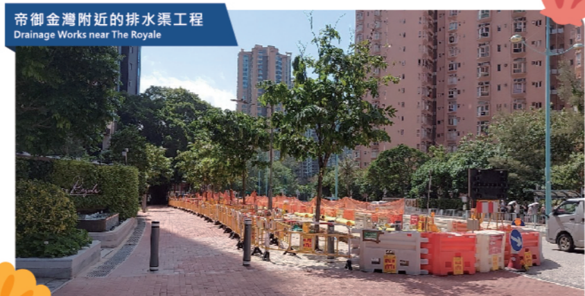
帝御金灣附近的排水渠工程 Drainage Works near The Royale