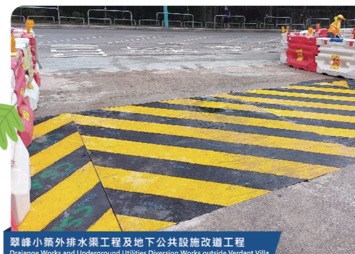
翠峰小築外排水渠工程及地下公共設施改道工程 Drainage Works and Underground Utilities Diversion Works outside Verdant Villa