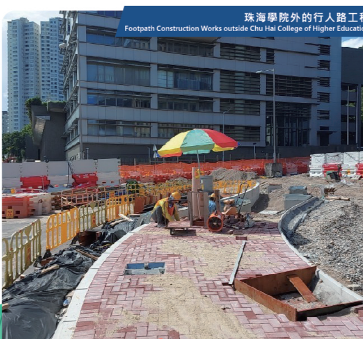
珠海學院外的行人路工程 Footpath Construction Works outside Chu Hai College of Higher Education